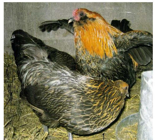
Notice in particular the strong lacing and shafting on the hens