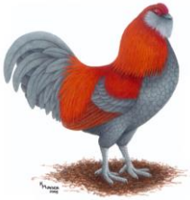
Blue Wheaten Portrait

The bantam silvers are always a challenge. I had two breeding pens setup for them and don't know at this point if any progress was made this season. Getting them to breed true is a problem yet and they need improvements in pattern, color and type. We'll worry about shafting in the future. I do plan to improve their temperament, but that is a long term one. As a matter of fact it is the same special breeding plan I'm using with LF silvers. I'm crossing them with wheaten. I hatched the F2 generation of LF from this project and am encouraged by the looks of the chicks. In this LF project I'm breeding both ways...to improve silvers and also wheaten. The F2 chicks that are \frac{3}{4} wheaten and \frac{1}{4} silver, that I've kept, had wheaten down color/pattern and the other than striping in their hackles the pullets look very nice so far. I'm not recommending that others try this same cross. It produced many Easter Eggers along the way and that was expected. Before getting into a breeding project that involves crossing one variety with another I would suggest discussing it as a topic on the ABC Forum and get the input of many other breeders. I've made some crosses over the years that got me nowhere. They were disappointing and ended up a waste of time.