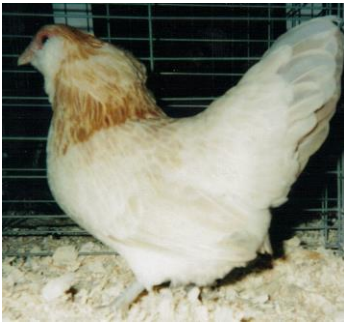
This bantam blue wheaten pullet has exceptional tail color!

Take time and trouble to show your birds at their very best!