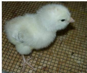
Wheaten Bantam Chick By John Blehm

I'm concentrating on improving some of the varieties and certain characteristics. The bantam lavenders are coming along well and I've mated a LF black cock over some bantam lavender pullets to create my F1 generation of LF lavenders. All of these chicks are black but should produce some lavender when mated together next year.