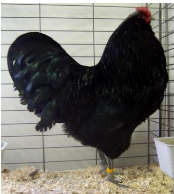
Paul and Angela Smith's large fowl black cockerel Reserve Champion Ameraucana at Eastern Iowa.