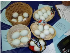
Eggs at the National Meet