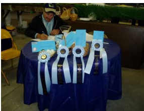
Egg awards at the National Meet