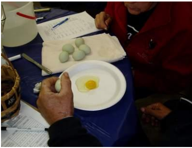
Egg Judging at National Meet