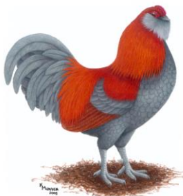
Blue Wheaten Portrait