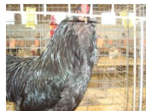
Kathy Gratch's large fowl black at the Northeast District Meet.