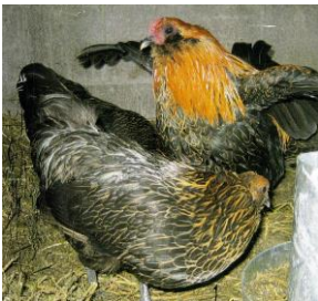
Black Gold Pair

COMB, FACE, AND EARLOBES: Red HEAD: Golden bay BEARD & MUFFS: Light golden brown tinged with grey NECK: Hackle – Golden bay, slight black striping permitted in lower hackle Front of Neck – Golden orange BACK: Golden bay, each feather penciled with a single broad band of black SADDLE: Brilliant black, each feather laced with golden orange and with straw colored shafting TAIL: Main Tail – black with straw colored shafting Sickles, Lesser Sickles and Coverts – brilliant black with light orange shafting and thinly laced with light orange WINGS: Bows – Deep orange bay Coverts – Orange bay Primaries – Dull black, leading edge light gold coarsely stippled with black, straw colored shafting Secondaries – Black, lower edge orange-gold stippled with black, producing a wing bay of orange gold heavily stippled with black BREAST: Upper breast – same as front of neck Lower breast and Upper Thighs – Orange gold, each feather having a broad single penciling of black BODY, STERN, and FLUFF: Dull black irregularly barred with light golden orange LOWER THIGHS: Same as body and stern UNDERCOLOR: Slate