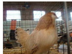
Kathy Gratch's bantam wheaten at the Northeast District Meet.

I hope all have a good summer and good luck at the fairs this summer. The fall shows are just around the corner! Until next time . . . Rob