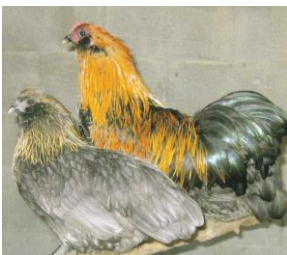
Blue Gold Hen and Black Gold Cock

COMB, FACE, AND EARLOBES: Red HEAD: Golden bay BEARD & MUFFS: Light golden brown tinged with grey NECK: Hackle – Golden bay, slight black striping permitted in lower hackle Front of Neck – Golden orange BACK: Golden bay, each feather penciled with a single broad band of black SADDLE: Brilliant black, each feather laced with golden orange and with straw colored shafting TAIL: Main Tail – black with straw colored shafting Sickles, Lesser Sickles and Coverts – brilliant black with light orange shafting and thinly laced with light orange WINGS: Bows – Deep orange bay Coverts – Orange bay Primaries – Dull black, leading edge light gold coarsely stippled with black, straw colored shafting Secondaries – Black, lower edge orange-gold stippled with black, producing a wing bay of orange gold heavily stippled with black BREAST: Upper breast – same as front of neck Lower breast and Upper Thighs – Orange gold, each feather having a broad single penciling of black BODY, STERN, and FLUFF: Dull black irregularly barred with light golden orange LOWER THIGHS: Same as body and stern UNDERCOLOR: Slate